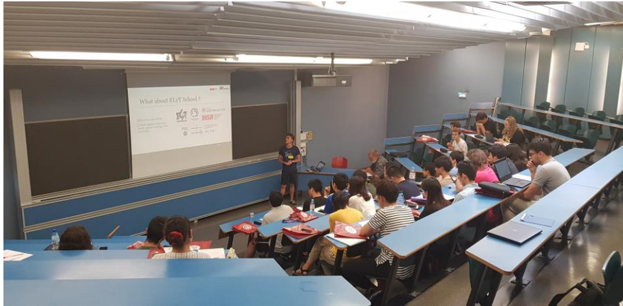
During a student presentation at ECL

The program was devoted to both scientific and cultural aspects, with the participation of campus laboratories. The general theme was "Energy, Environment, Safety and Engineering". A significant part of the ELYT School was based on presentations by French or Japanese teacher-researchers (9 in total). They had chosen themes that covered the broad spectrum of students' backgrounds and the ELYT School's theme, while being in line with the subjects developed by ELYT Global. Each student also made a presentation on his or her personal and academic background.