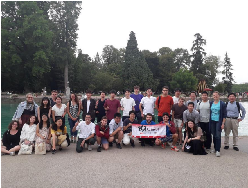
Trip to Annecy

This edition of ELYT School was made possible thanks to the support of several organizations: the MANUTECH-SISE labex, the IngéLyse federation, the LIA CNRS ELYT Global, the UMI CNRS ELYTMax, the CNRS, the University of Lyon, the Auvergne-Rhône-Alpes region, JASSO, the INSA of Lyon, the ECL and Tohoku University, for which we warmly thank you.